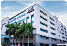
India Branch in Chennai