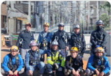
Japan Branch in Tokyo