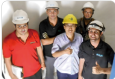
Brazil Branch in Jaraguá do Sul