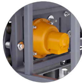
Overload Safety Device