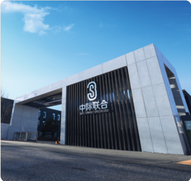
Headquarters in Beijing

● Headquarters ● Subsidiary ● Countries and regions where 3S products are used