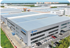
Factory in Tianjin