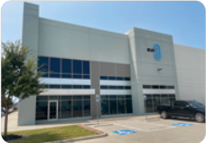
North America Branch in Dallas