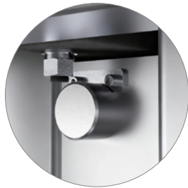
Overload Detection Device