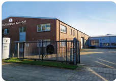
Europe Branch in Hamburg