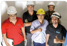
Brazil Branch in Jaraguá do Sul