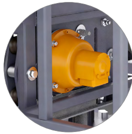
Overload Safety Device