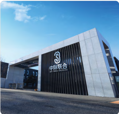
Headquarters in Beijing

● Headquarters ● Subsidiary ● Countries and regions where 3S products are used