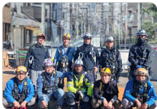
Japan Branch in Tokyo