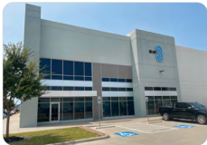
North America Branch in Dallas