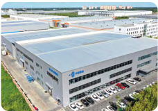
Factory in Tianjin