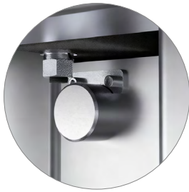
Overload Detection Device