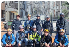
Japan Branch in Tokyo