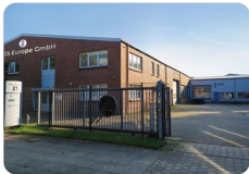
Europe Branch in Hamburg