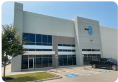
North America Branch in Dallas