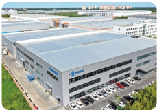
Factory in Tianjin