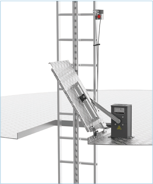
IHM-15 Side-Opening Model