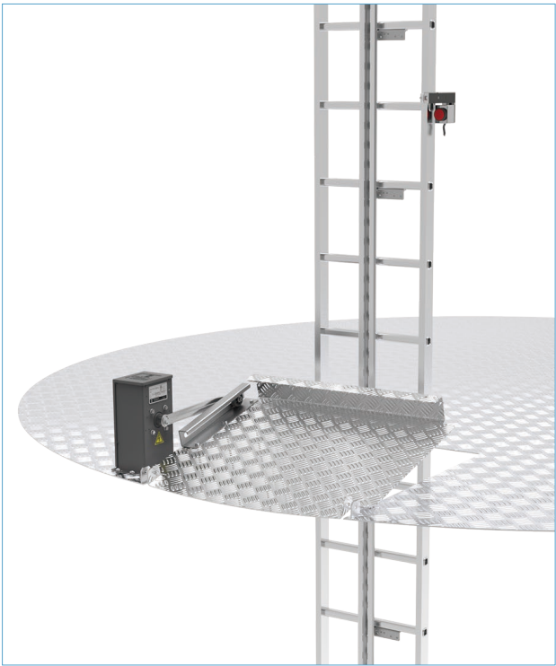
IHA-15 Back--Opening Model

The AHO can be quickly and easily installed, using only a few screws to mount it.